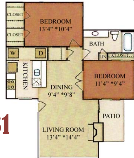
2 Bedroom / 1 Bath - 852 Sq. Ft.*