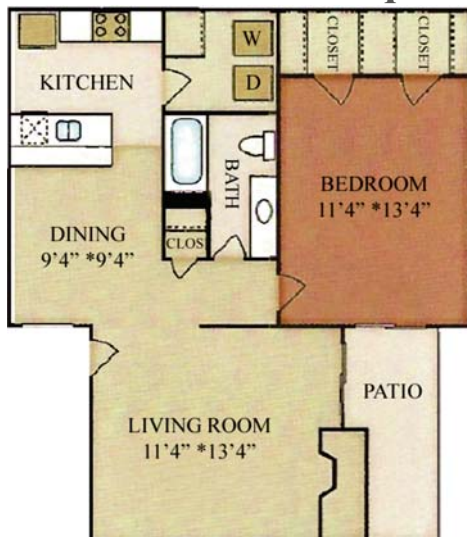
1 Bedroom / 1 Bath - 711 Sq. Ft.*