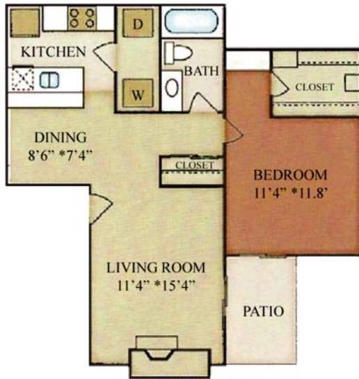
1 Bedroom / 1 Bath - 686 Sq. Ft.*