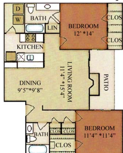
2 Bedroom / 2 Bath - 971 Sq. Ft.*