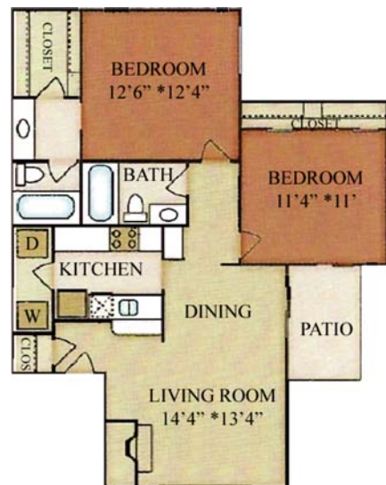
2 Bedroom / 2 Bath - 921 Sq. Ft.*