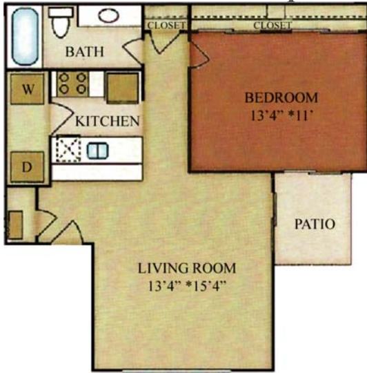
1 Bedroom / 1 Bath - 643 Sq. Ft.*